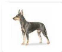
Manchester Terrier (Toy)