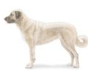
Anatolian Shepherd Dog