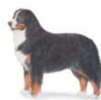
Bernese Mountain Dog