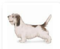
Petit Basset Griffon Vendéen