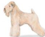
Soft Coated Wheaten Terrier