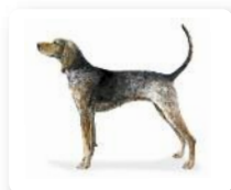
American English Coonhound