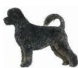
Portuguese Water Dog