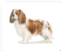
Cavalier King Charles Spaniel