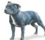
Staffordshire Bull Terrier