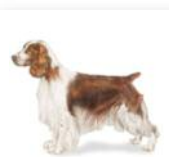
Welsh Springer Spaniel