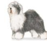
Old English Sheepdog