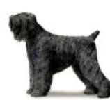
Black Russian Terrier