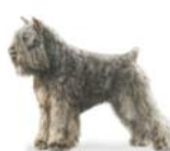
Bouvier des Flandres