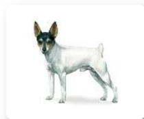
Toy Fox Terrier