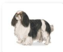
English Toy Spaniel