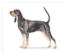
Black and Tan Coonhound