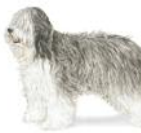
Polish Lowland Sheepdog