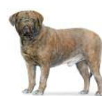
Dogue de Bordeaux