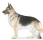
German Shepherd Dog