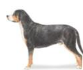
Greater Swiss Mountain Dog